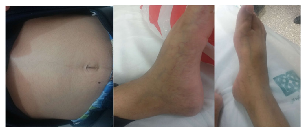
Fig. 2 Telangiectasia in abdomen and extremities of lower limbs