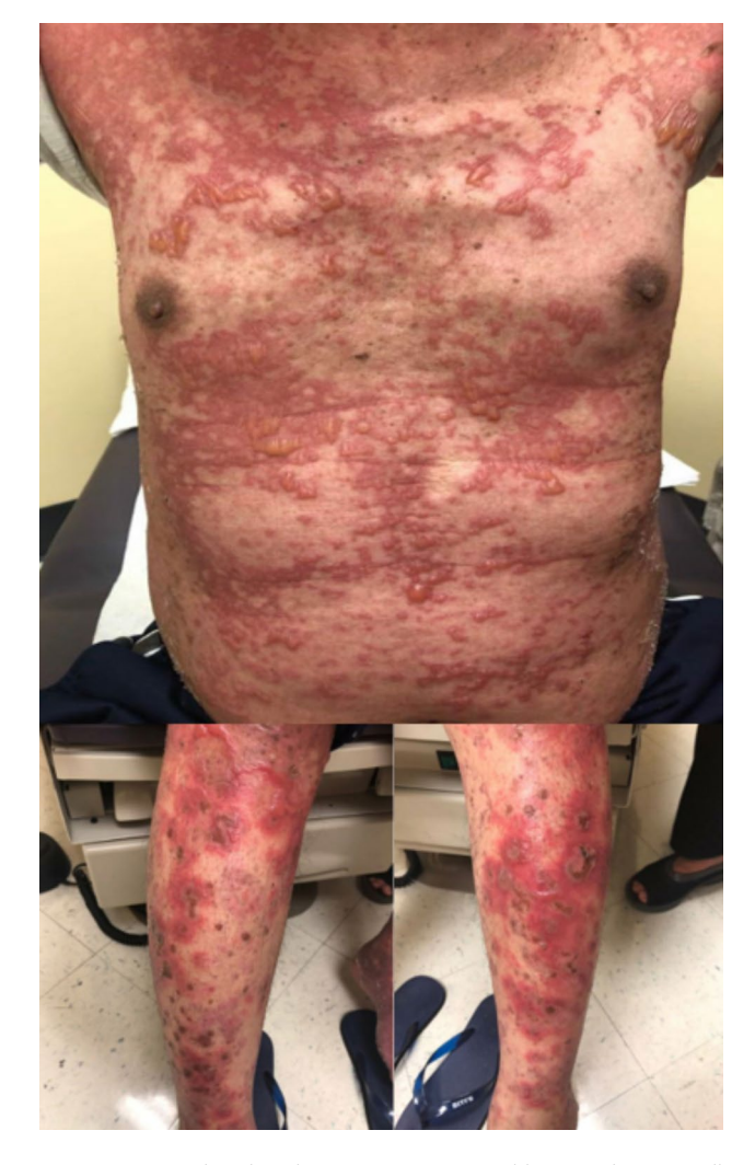
Fig. 1 Osimertinib-induced SJS/TEN in a 63-year-old man with non-small cell lung cancer

The patient was diagnosed with EGFR L858R mutation-positive NSCLC with bone metastasis and received