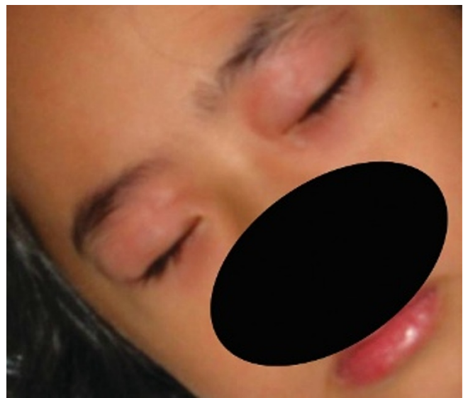
Figure 2. Periorbital urticarial lesions and lower lip angioedema in a 5-year-old girl after oral provocation with 5 mg/kg of ibuprofen.

variations between research centres and practitioners abound. Protocols for challenge, as summarized in Middleton's chapter on ASA hypersensitivity, vary also according to the clinical presentation and the putative mechanism of action. 4 In the article by Rachelefsky and colleagues 11 investigating AERD in asthmatic children 6 to 18 years old, 300 mg of ASA or 100 mg of placebo was given on two separate days. Fourteen of 50 children (28%) responded with more than a 30% decrease in their pulmonary function tests after ASA ingestion, on average worse at 4 hours after challenge than at 30 minutes. Eleven of these 14 patients complained of continuing symptoms for the next 24 hours after challenge. This and similar publications support the use of a prolonged (over several