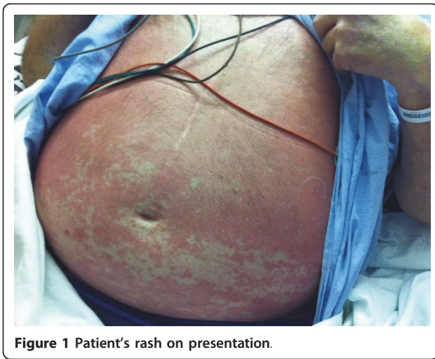
Figure 1 Patient's rash on presentation.

computed tomography (CT) scan of his pelvis showed no abscess formation. A skin biopsy of the initial rash showed a mild perivascular lymphocytic infiltrate, consistent with a drug reaction.