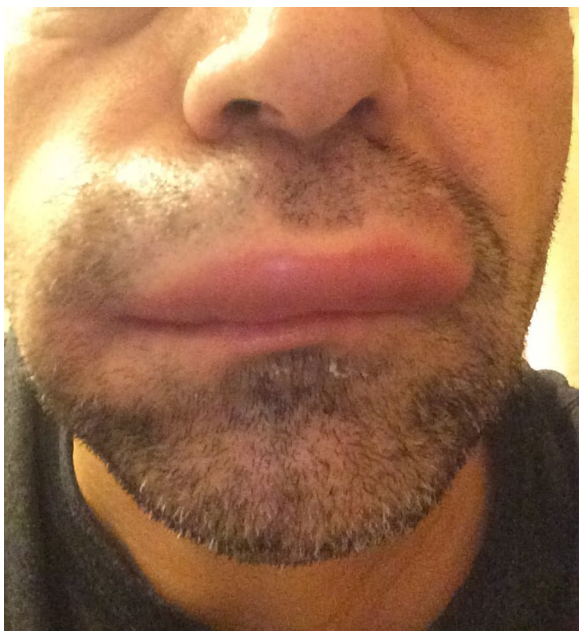
Fig. 5 Idiopathic angioedema

to monitor QOL [e.g., Chronic Urticaria Quality of Life Questionnaire (CU-Q2oL)] and to quantify disease activity (the Urticaria Activity Score) have been