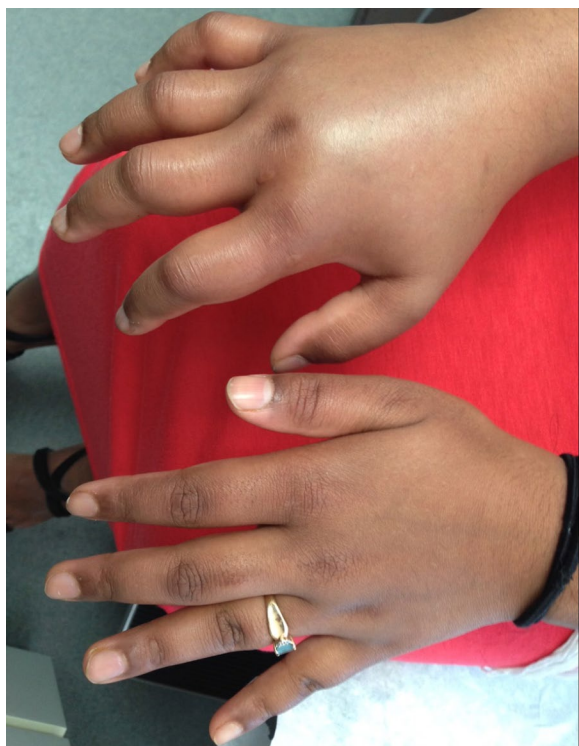
Fig. 4 Hereditary angioedema (HAE)