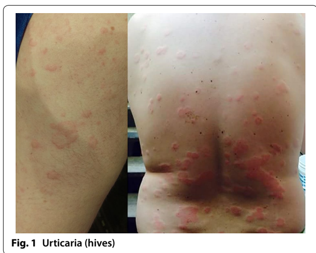
Fig. 1 Urticaria (hives)

chronic, severe urticaria is often associated with significant morbidity and diminished quality of life (QOL) [8]. Inducible urticaria also tends to be more severe and long-lasting, and can sometimes be challenging to treat [1, 3].